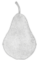
Bosc (russet brown)