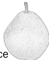
Comice (green with a red blush)