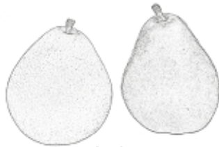
Anjou (green and red)