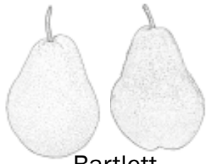
Bartlett (yellow and red)

These are the main varieties of pears grown in Oregon and Washington.